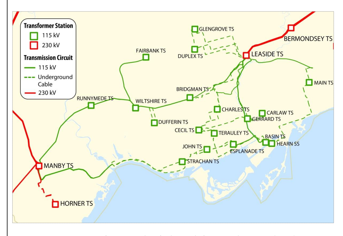
Figure 1-2 Electrical Supply in Central Toronto (Inset)