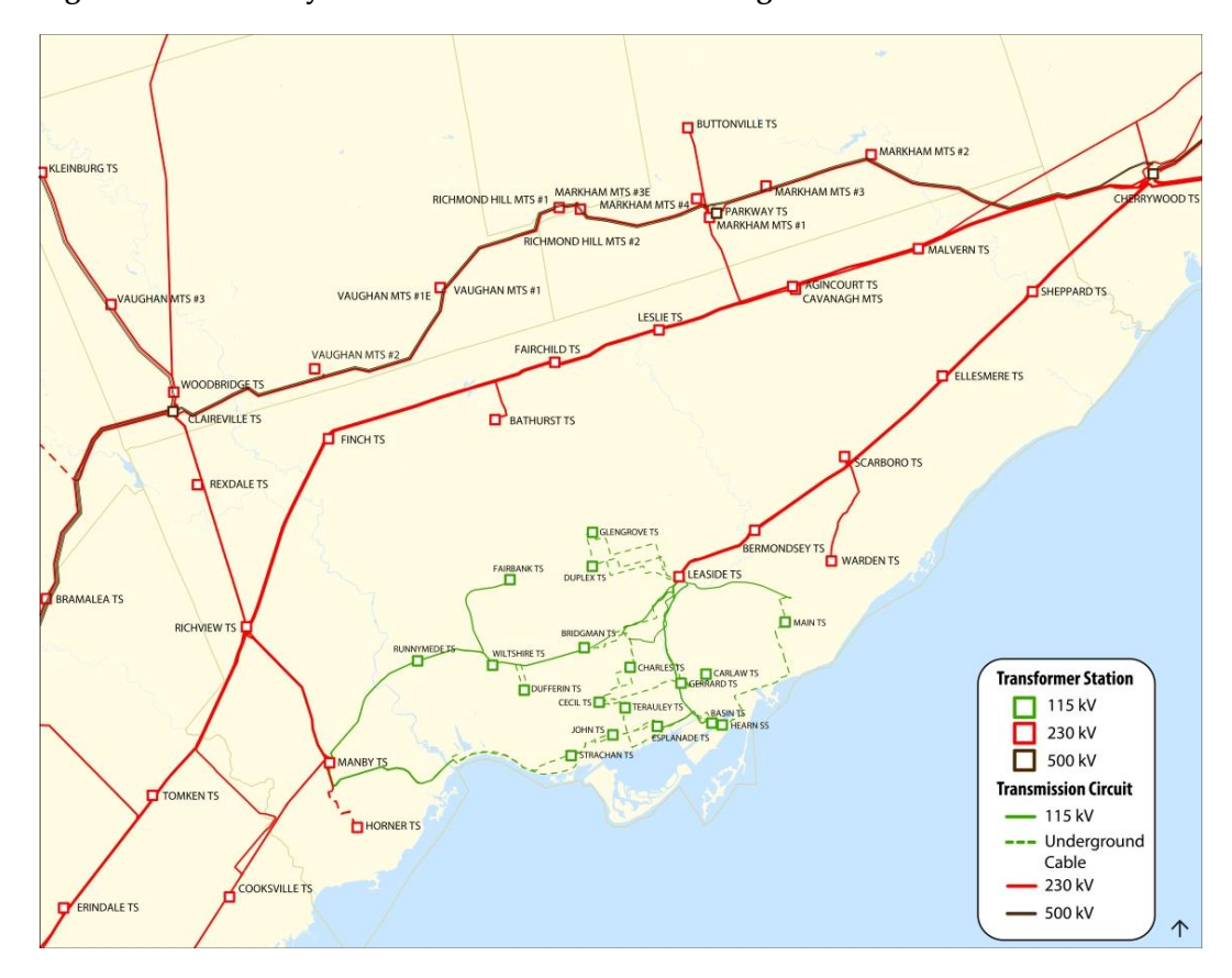
Figure A-1 Electricity Infrastructure in the Toronto Region