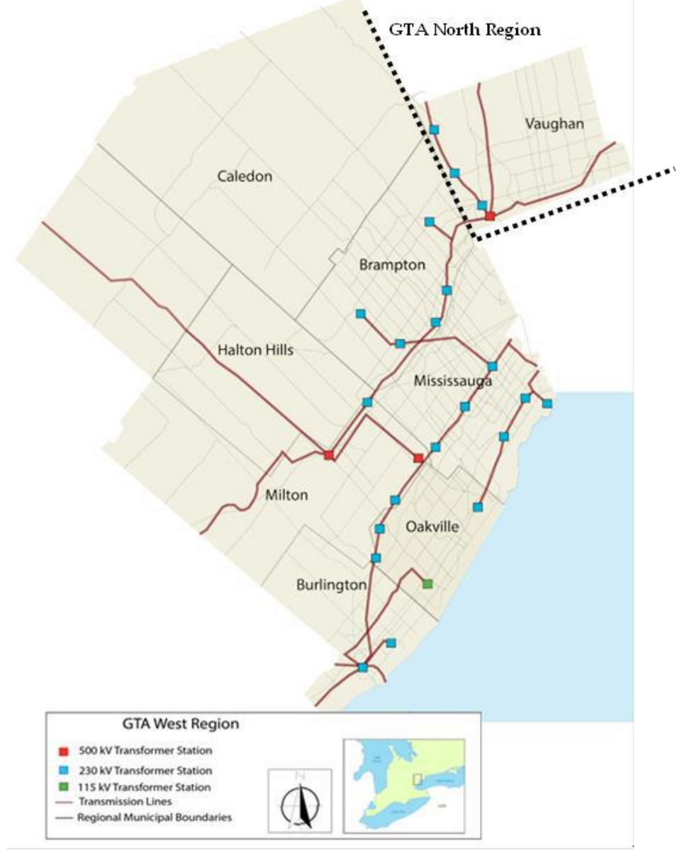
Figure 1 Geographical Area of the GTA WEST Region with Electrical Layout