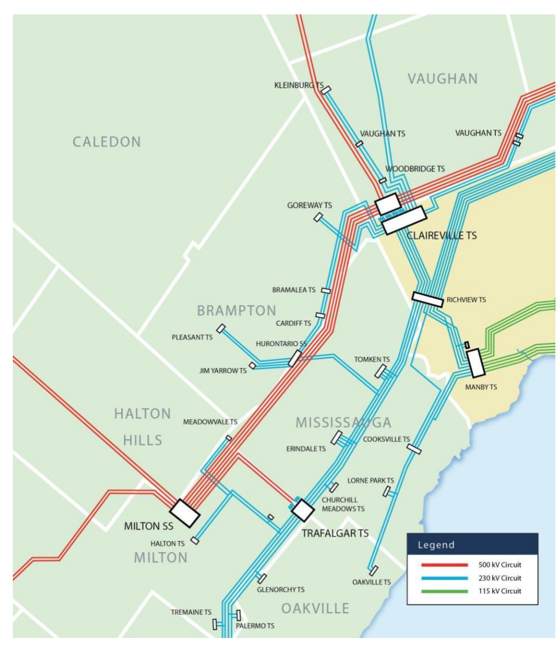
Figure 1 Geographical Area of the GTA West Region with Electrical Layout