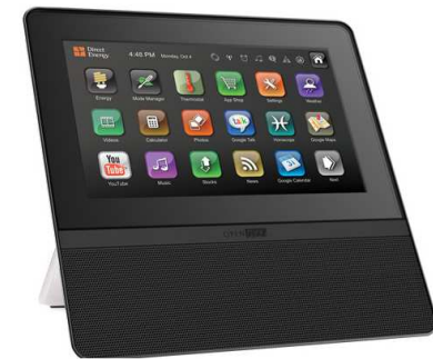
HomeConnect connects with Smart Meter