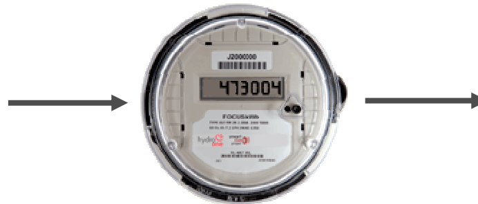
AMI network grants access and specifies Smart Meter to connect