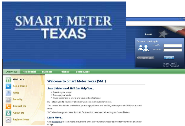
DE requests connection to customer's Smart Meter