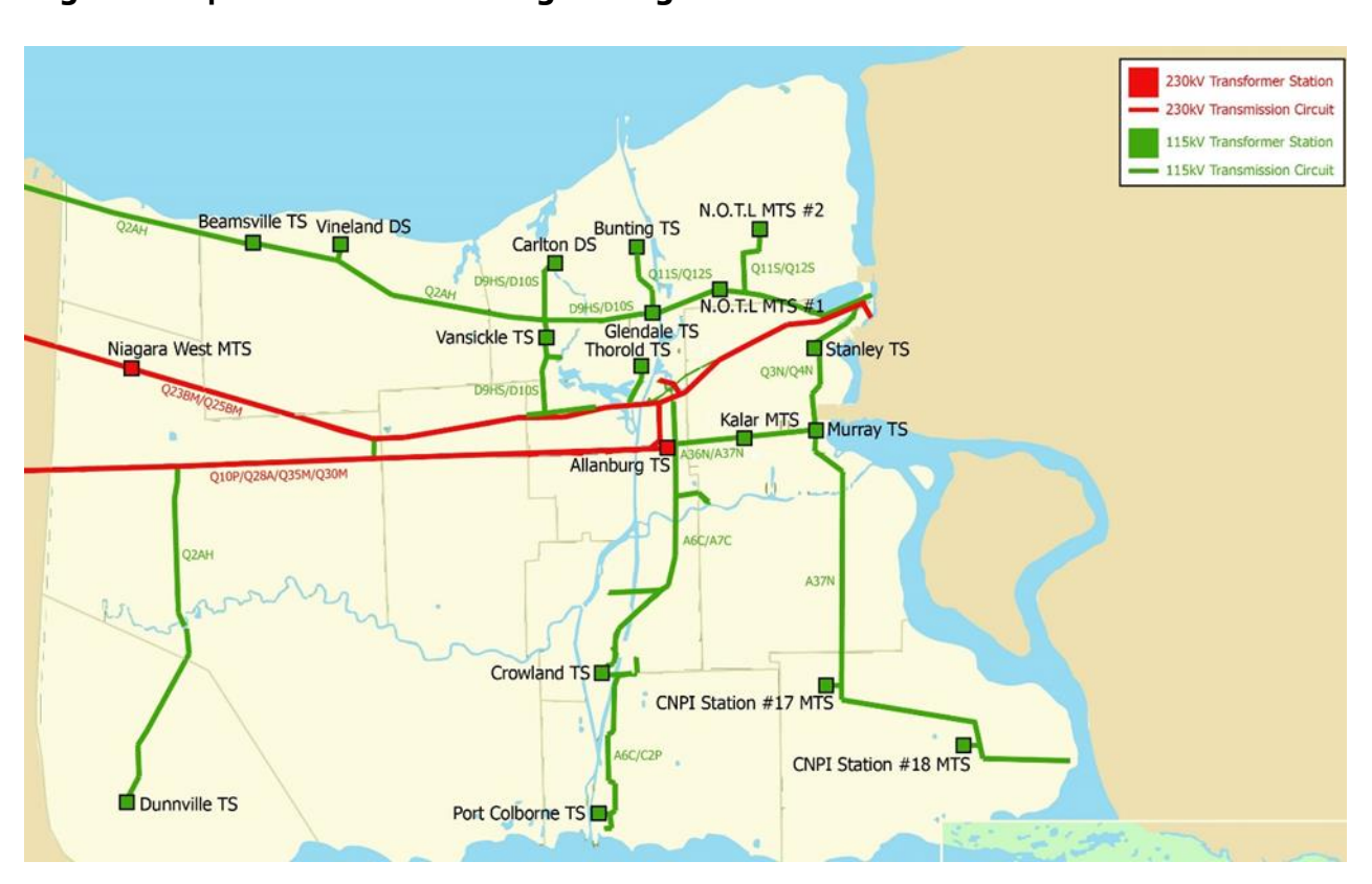
Figure A-3 | Overview of the Niagara Region

The Niagara region is summer-peaking and supplied primarily from 230/115 kV autotransformers at Allanburg TS, with local generation at Sir Adam Beck #1, Sir Adam Beck #2, Decew Falls GS, and Thorold GS. The approximate geographical boundaries of the region are shown in Figure A-3.