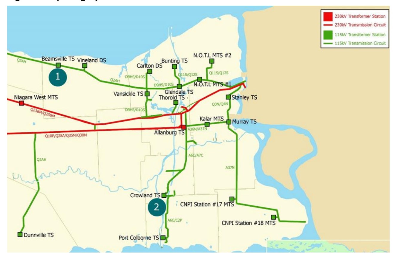
Figure 3-3 | Geographic Location of Needs Identified in the Needs Assessment