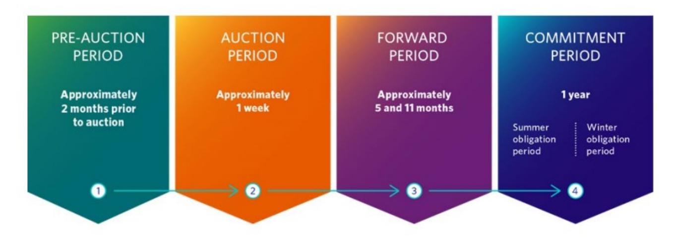
Figure 1: Capacity Auction Timeline

The Capacity Auction is broken down into four major auction periods, as presented with the associated timelines in the figure below.