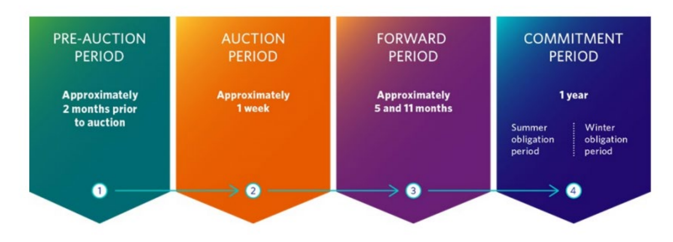
Figure 1: Capacity Auction Timeline

The Capacity Auction is broken down into four major auction periods, as presented with the associated timelines in the figure below.