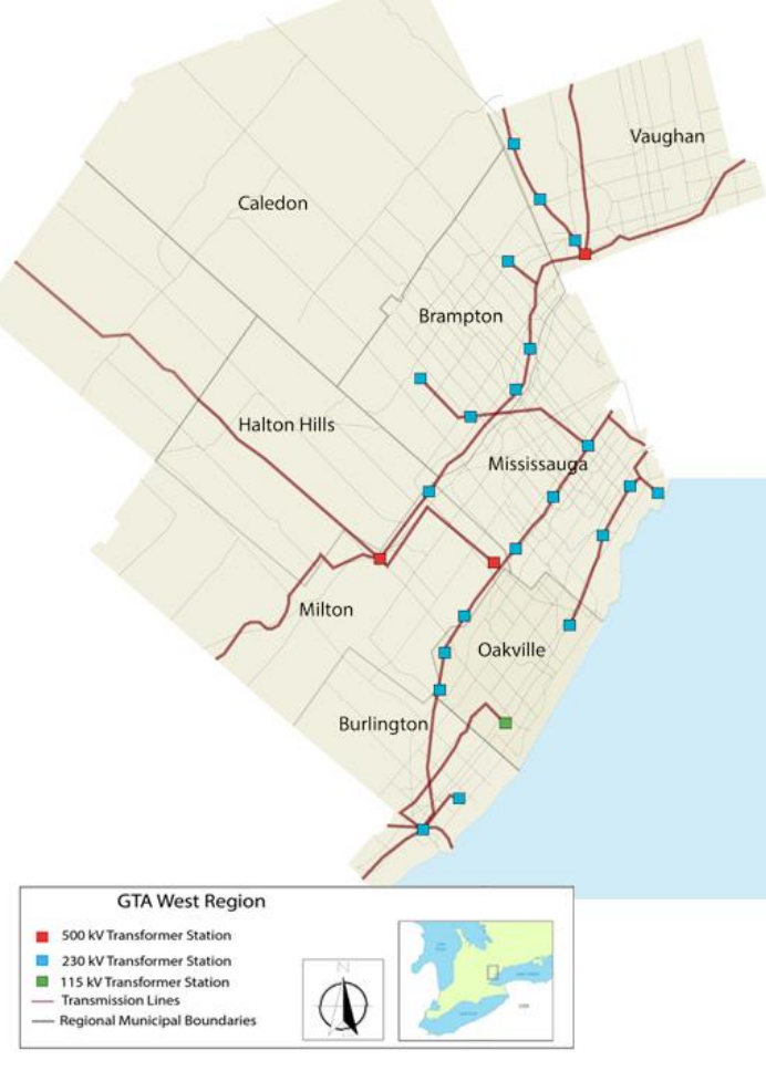
Figure 1 - Map of GTA West Region

Population and growth rate forecasts and information on local economic development, projected growth and future plans, especially around areas of intensification to determine the electricity demand forecast and needs for the region