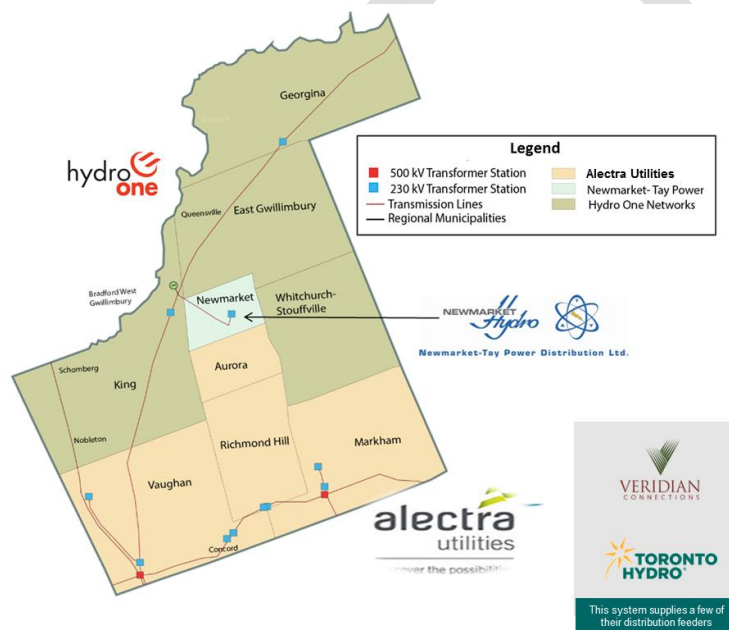
Figure 1: Geographical Boundaries of GTA North (York Region)

GTA North Region (York Region) is one of the fastest growing regions in Ontario. Provincial policies, including the Places to Grow Act and the Greenbelt Act, have played a key role in facilitating and driving development in this region. While a large portion of the land in this region is part of the designated Greenbelt area and is protected from urban development, the 2005 Places to Grow Act has promoted rapid intensification and development in specific designated urban areas surrounding and south of the Greenbelt. Extensive urbanization in these areas over the past decade has resulted in continued increase in electricity demand. In 2017, GTA North (York Region) had an electricity demand peak of over 2000 MW. Under the updated province's Places to Grow Act 2017, significant population growth and intensification are expected to continue in GTA North (York Region) in the coming decades.