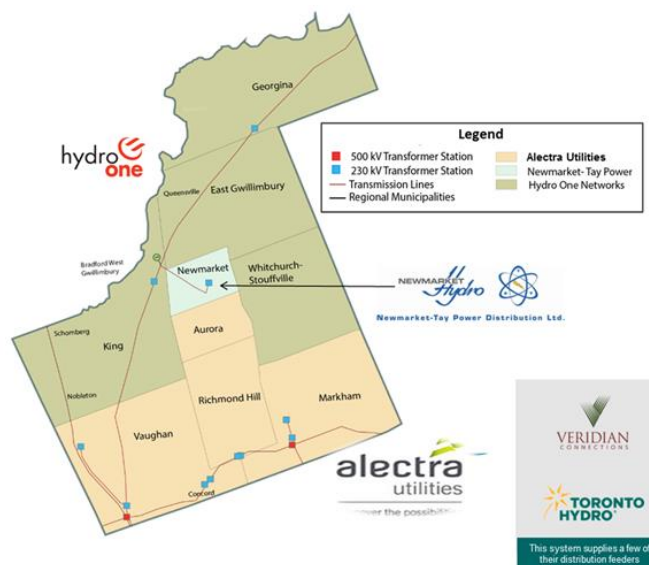
Figure B-2: Geographical Boundaries of GTA North (York Region)

The GTA North Region (York Region), as shown in Figure B-1, roughly comprises of municipalities in York Region (Vaughan, Richmond Hill, Markham, Aurora, Newmarket, King, East Gwillimbury, Whitchurch-Stouffville and Georgina) and Chippewas of Georgina Island. Its electrical infrastructure also serves parts of the City of Toronto, Brampton, and Mississauga.