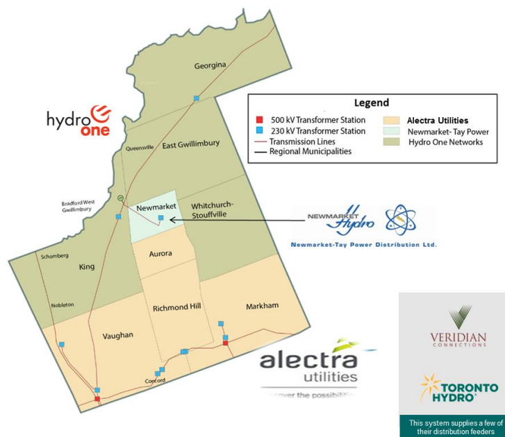
Figure 1: Geographical Boundaries of GTA North (York Region)

GTA North Region (York Region) is one of the fastest growing regions in Ontario. Provincial policies, including the Places to Grow Act and the Greenbelt Act, have played a key role in facilitating and driving development in this region. While a large portion of the land in this region is part of the designated Greenbelt area and is protected from urban development, the 2005 Places to Grow Act has promoted rapid intensification and development in specific designated urban areas surrounding and south of the Greenbelt. Extensive urbanization in these areas over the past decade has resulted in continued increase in electricity demand. In 2017, GTA North (York Region) had an electricity demand peak of over 2000 MW. Under the updated province's Places to Grow Act 2017, significant population growth and intensification are expected to continue in GTA North (York Region) in the coming decades.