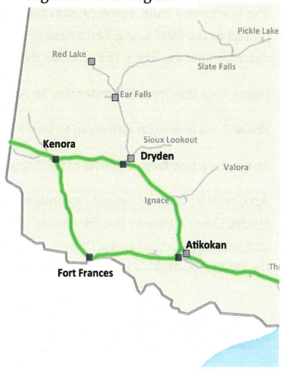
Figure 1 – The Region

The IESO's updated electrical load forecast also includes high and low growth scenarios to capture the uncertainty around industrial developments. Under the high growth scenario, which considers