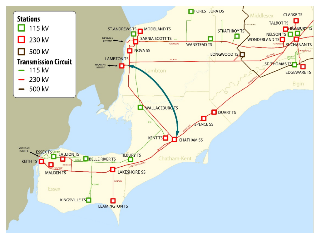
Figure 1: Proposed transmission line connects Lambton TS and Chatham SS. Exact route to be determined.

This agricultural electricity demand is expected to grow from roughly 500 megawatts (MW) to 2,000 MW from now to 2035. To ensure the region has the power needed to support this growth, a new 230-kilovolt double circuit transmission line is being developed by Hydro One between Lambton Transmission Station and Chatham Switching Station.